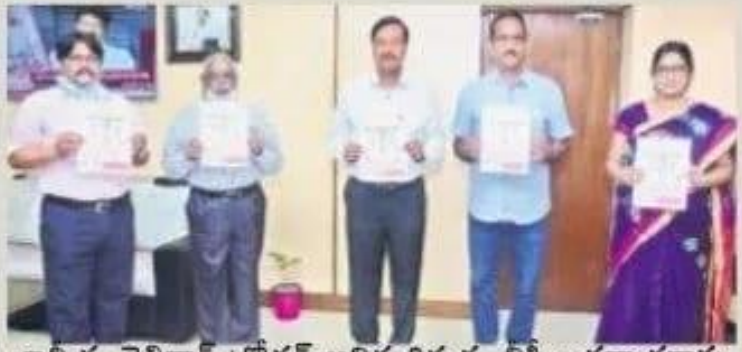
జాతీయ వెబినార్ క్రోచర్ ఆవిష్కరిస్తున్న వీసీ జగన్నాథరావు